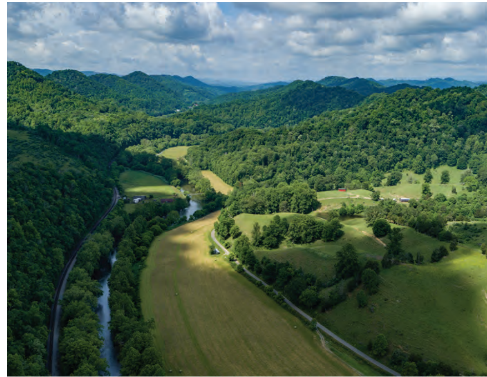
Clinch River access near Artrip

The good news is that TNC is working with a coalition to advance Virginia’s Great Outdoors Act in the General Assembly. The bill would increase funding to repair and improve existing parks and trails, invest in new resources, and protect our most valuable natural spaces so that the outdoors is accessible to all.