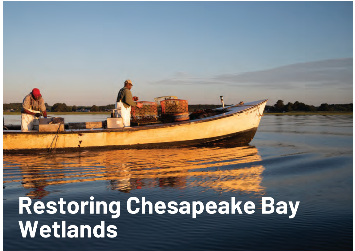
Watermen pulling crab pots

IN APRIL, KATI BOOTH TRANSITIONED FROM OUR STATEWIDE WETLAND and stream restoration team to lead Virginia's work protecting and restoring wetlands in the Chesapeake Bay watershed. Booth collaborates with TNC Bay team colleagues in Maryland, Delaware and Pennsylvania—along with conservation and government relations staff—to advance our ambitious goals: