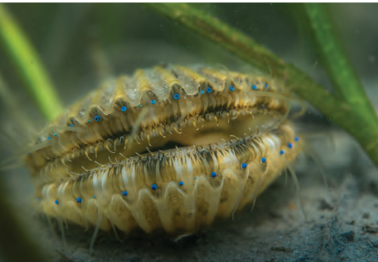
Bay scallop in restored seagrass meadow