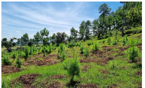
Cover: Oak Tree © Costin79/Adobe Stock, Above, clockwise from top left: Planting teams in Kenya, Colombia and Mexico © TNC; Reforestation area in Guatemala © TNC; Seeds of native tree species for restoration in Brazil © TNC. Right: Yunnan golden monkey, Yunnan Province, China © Long Yongcheng