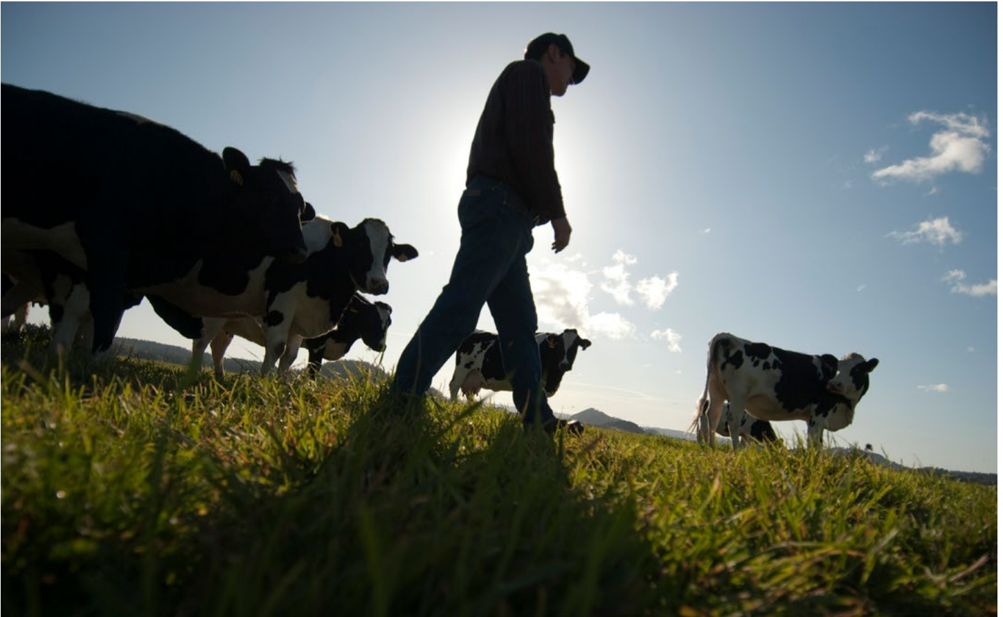
The Dairy Feed in Focus program is designed to help dairy farmers and the supply chain meet the growing demand for food while protecting our environment.

ECONOMIC & ENVIRONMENTAL BENEFITS FOR U.S. DAIRY FARMS OF ALL SIZES