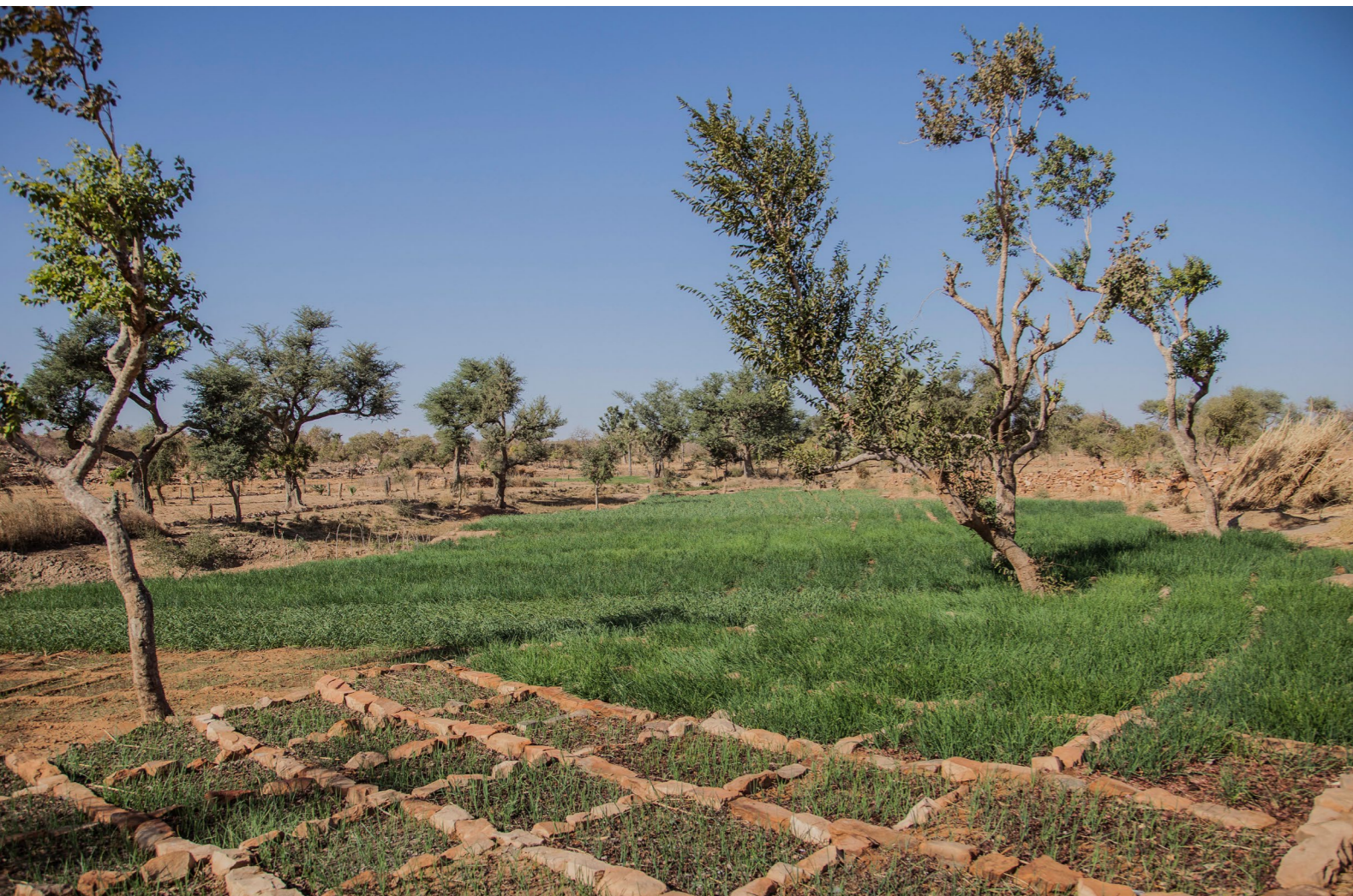
A field of onions in the village of Doura, Segou, Mali