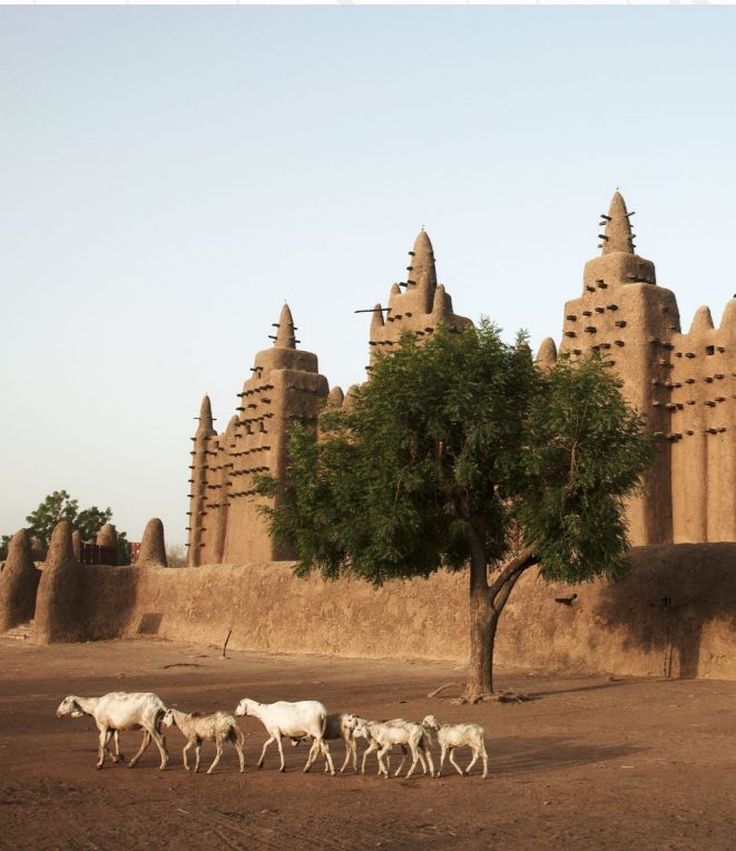
Livestock roam near the Great Mosque of Djenné, Mopti, Mali