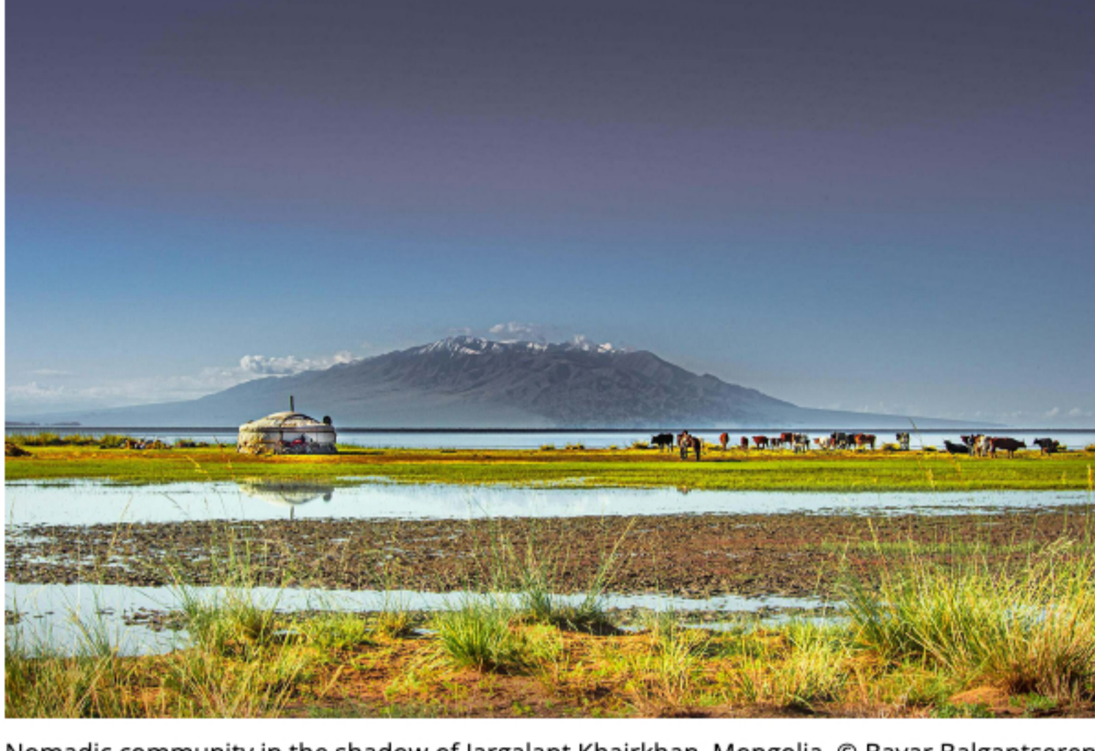
Nomadic community in the shadow of Jargalant Khaikhan, Mongolia.