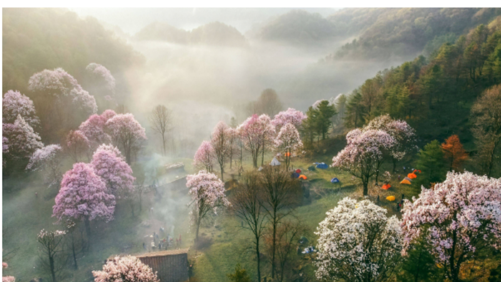
Camping among the flowers in China's Sichuan Province.

Ready for camping? Here's how spring camping looks among a sea of flowers in Mianyang, China's Sichuan Province. This captivating photo was submitted in TNC's 2022 Photo Contest.