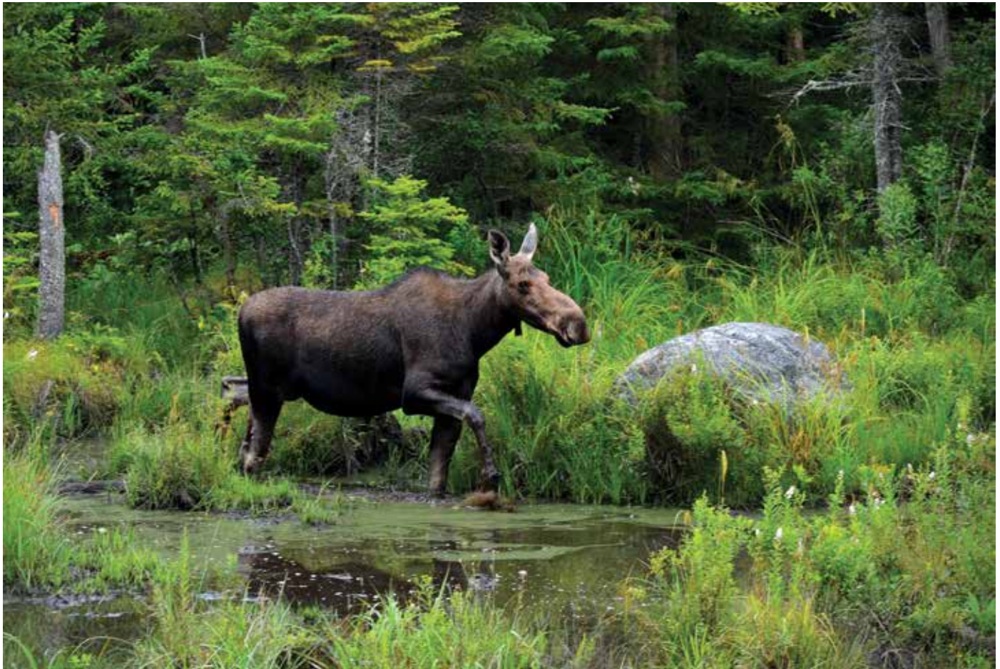
The majestic moose is one of the most iconic sights in the Adirondacks. Moose prefer forested habitat with streams and ponds.