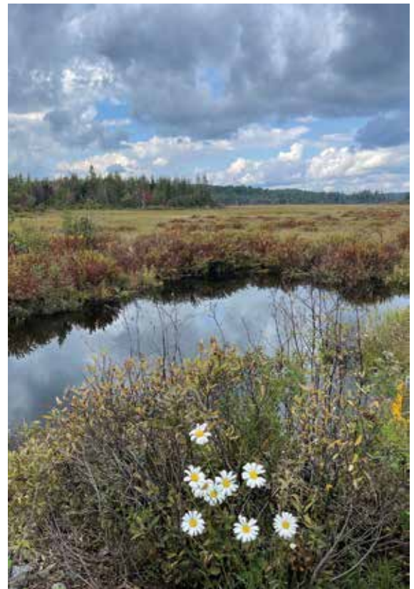
Along the shores of Follensby Pond