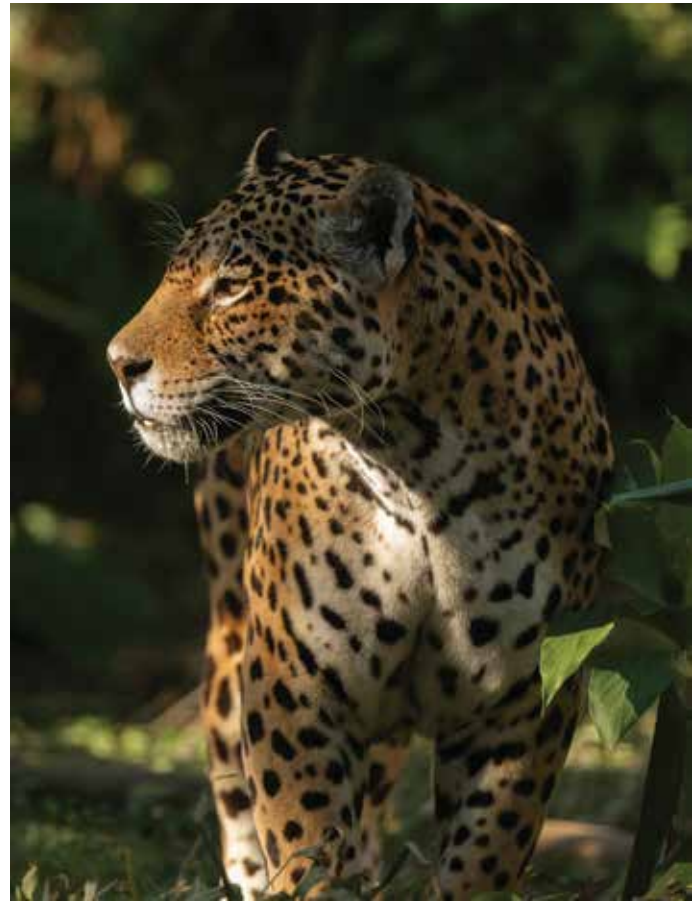
The jaguar is the biggest cat species in the Americas.

Conservation Status – Most birds are threatened by climate change, and Blackburnian warblers are no exception. Some models predict they could lose 54% of their breeding range if the average global temperature increases by 1.5 degrees Celsius. However, as of 2024 their populations are considered relatively stable. Clearing of their winter forests in South America, human disruptions along their migration route and the effects of climate change on the Appalachians are some of the greatest threats they face.