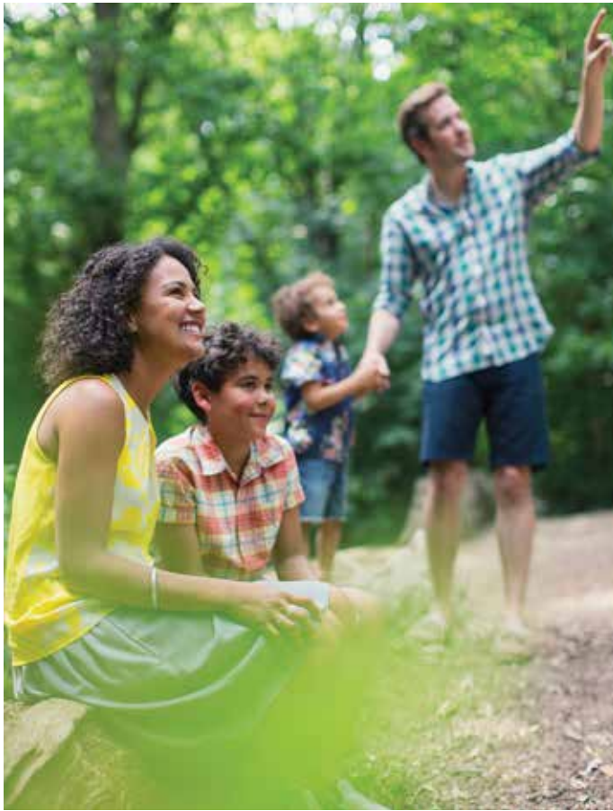
A family eagerly watches for birds during spring migration.

After traveling through the southern Appalachians for weeks, often flying all night and into the morning, the winged wonder lands in Virginia's highlands. He's joined by flocks of other neotropical warblers, including bay-breasted, chestnut-sided, and cerulean warblers he met over farmland in North Carolina. They are also joined by several northbound hoary bats whose 16-inch leathery wingspans dwarf those of the warblers and whose sharp white teeth shine in the moonlight. Luckily, hoary bats eat only insects, so bats and birds briefly share the same nocturnal flight.