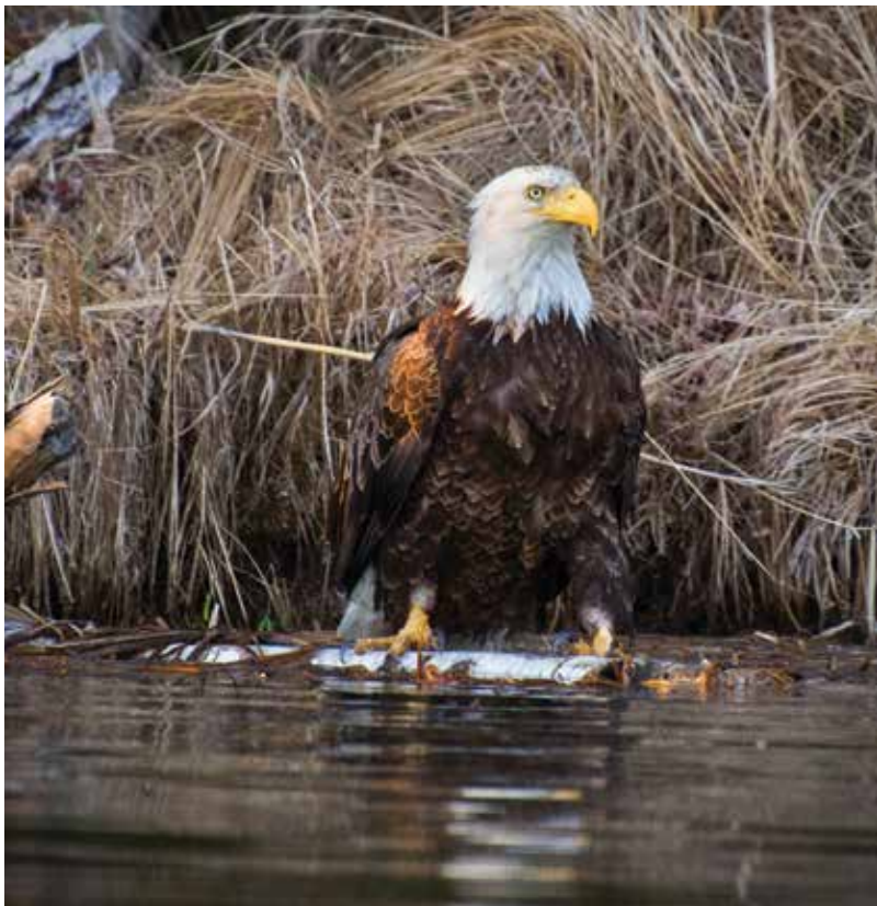
Bald eagles were introduced to Follensby in the 1960s.

The Nature Conservancy and the New York State Department of Environmental Conservation are establishing a public-private science consortium to collaborate on novel research here and guide the ecological management of this preserve. Follensby Pond will serve as a living laboratory and as a lifeboat for cold-water species in the face of climate change; it will be a destination for researchers worldwide.