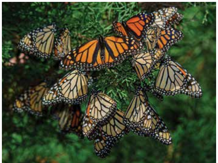
Monarch butterflies roost together during migration.