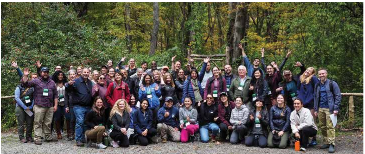
Nature Conservancy team members from across the state at Mianus River Gorge Preserve in Bedford, NY. Purchased in 1955, this site is The Nature Conservancy's first land preservation project.

To learn more about specific preserves or to get involved in The Nature Conservancy's work, visit nature.org/newyork