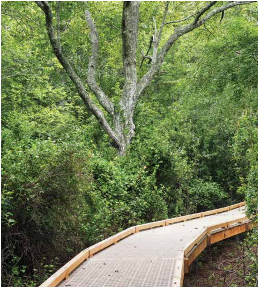
A new accessible trail at Wolf Swamp Preserve, Southampton, New York