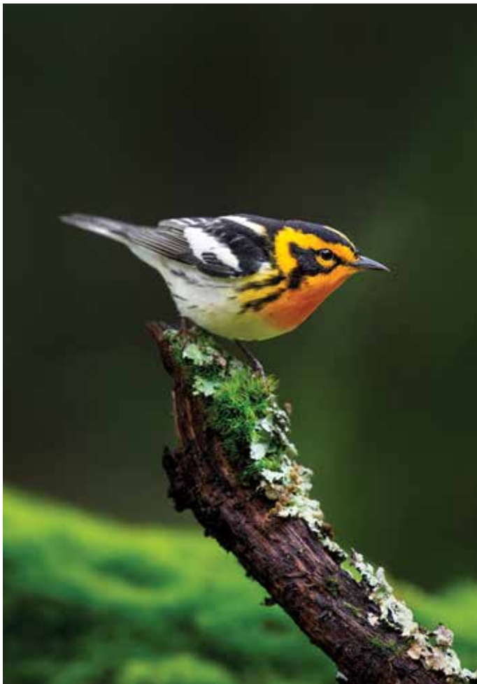
A striking orange and black male Blackburnian warbler

The Blackburnian warbler survives a stormy trip across the Gulf of Mexico, then settles in before dawn for a life-saving rest on the Georgia coast. He falls asleep next to a whip-poor-will who makes her spring home in The Nature Conservancy's Calverton Ponds Preserve on Long Island. A cluster of monarch butterflies, similar to the thousands he saw gliding north in Mexico, vibrate their wings to stay warm as they prepare to fly to Moody Forest Preserve in Georgia.