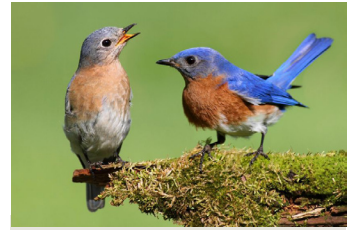
Eastern Bluebirds