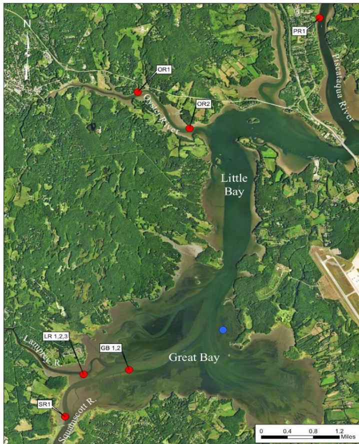
Figure 2. Map of Great Bay Estuary showing The Nature Conservancy's oyster reef restoration sites (red=historical restoration sites and blue circles =current restoration sites). Oysters grown by Oyster Conservationists in 2021 were placed on the oyster restoration site at Woodman Point on November 3 rd (WP, blue circle).

Once the cages were counted and measured, they were condensed by town into fish totes. Storms delayed the deployment of the oysters by more than a week. November 3 rd , TNC and JEL staff deployed the oysters grown by the Oyster Conservationist Program on a shell pile at the oyster restoration site at Woodman Point in Great Bay (Figure 2). This marked the end of the 2021 Oyster Conservationist Season.