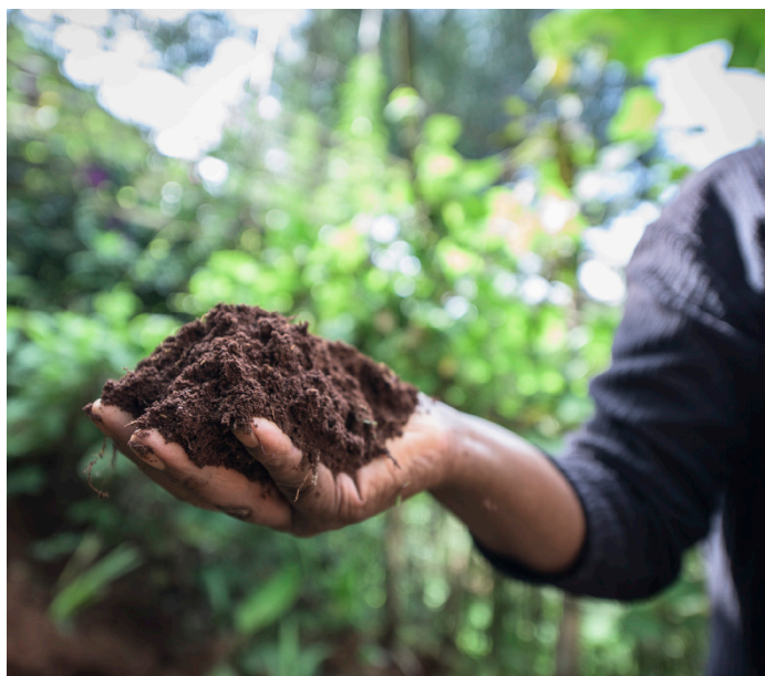
Jane Kibugi's holding fresh soil on her hillside farm in the Upper Tana Watershed, Kenya.

These solutions are available immediately, are scalable, and can transform key sectors of the global economy, such as forestry and agriculture – they are also available almost everywhere on the planet. Combined with innovations in clean energy and other efforts to decarbonize the world’s economies, natural climate solutions offer some of our best options in the response to climate change. A 2 or 1.5 degree Celsius stabilization pathway is unlikely to occur without taking land use more seriously. Or put simply, we cannot get there without nature.