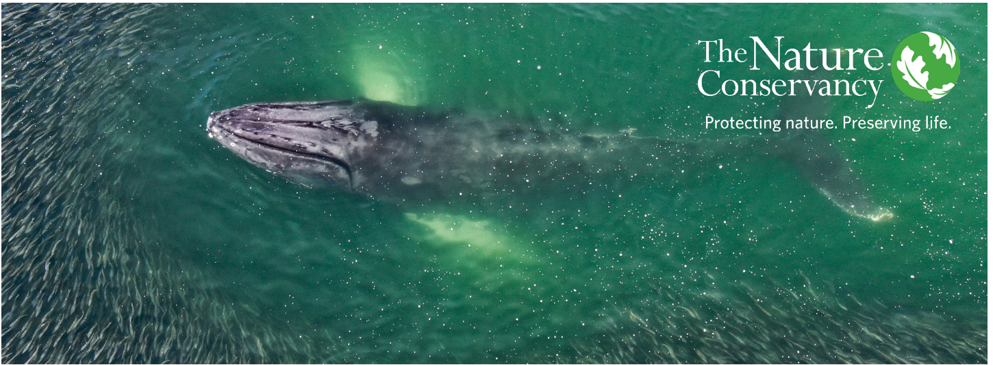
Humpback whale in school of menhaden