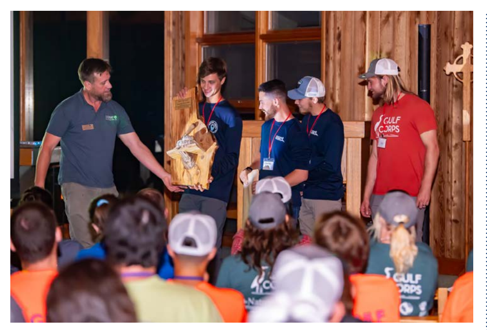
Conservation Corps of the Forgotten and Emerald Coasts members and staff receive the Oyster Reef Award during orientation at Beckwith Camp and Conference Center, Fairhope, Alabama, on September 18, 2023.