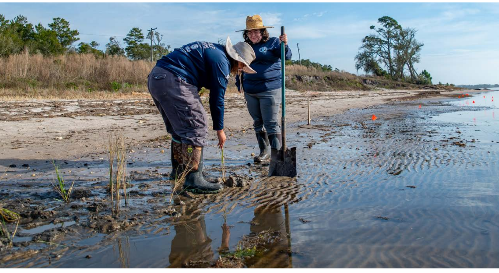
Conservation Corps of the Forgotten and Emerald Coasts crew members working on Franklin 98 Living Shoreline during spring 2024.

In 2018, GulfCorps launched in Florida with the Conservation Corps of the Forgotten Coast in Franklin County, part of Franklin's Promise Coalition, Inc (FPC). In Year 2, FPC added the Conservation Corps of the Emerald Coast in Escambia County and launched the Conservation Corps of the Emerald Coast in Bay County in Year 3. Franklin's Promise continues to run three crews across the Florida Panhandle. The RESTORE Council approved a new award in April 2021 and GulfCorps 2.0 launched in the fall of 2021. The crews partner with federal, state, county and municipal agencies as well as local nonprofits to implement restoration and conservation projects throughout the Florida Panhandle coast. This work includes mapping and treating invasive plant species; propagating and planting native vegetation; building living shorelines; participating in prescribed burns; and building and maintaining trails and boardwalks. Crews also collect and recycle oyster shells as part of the Santa Rosa County Oyster Shell Recycling program. Since the GulfCorps Program started, FPC crews have impacted over 4,500 acres of coastal habitats on 44 project sites.