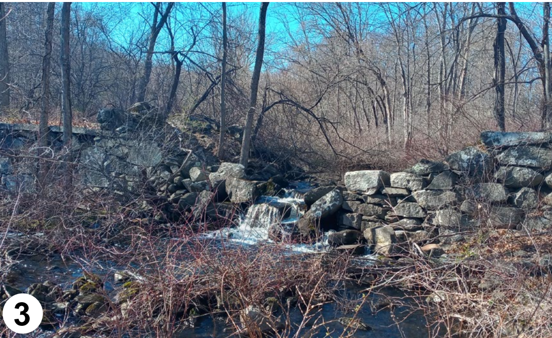
OLD STONE DAM