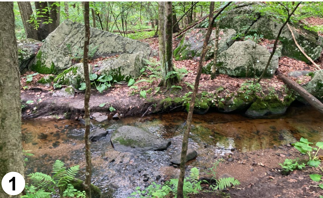
MOSHASSUCK RIVER & WETLAND HABITAT