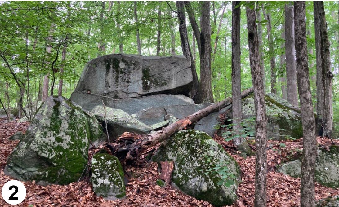
GEOLOGIC FEATURE / BOULDER FIELD