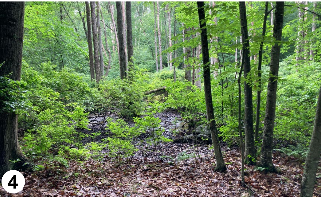
POTENTIAL VERNAL POOL