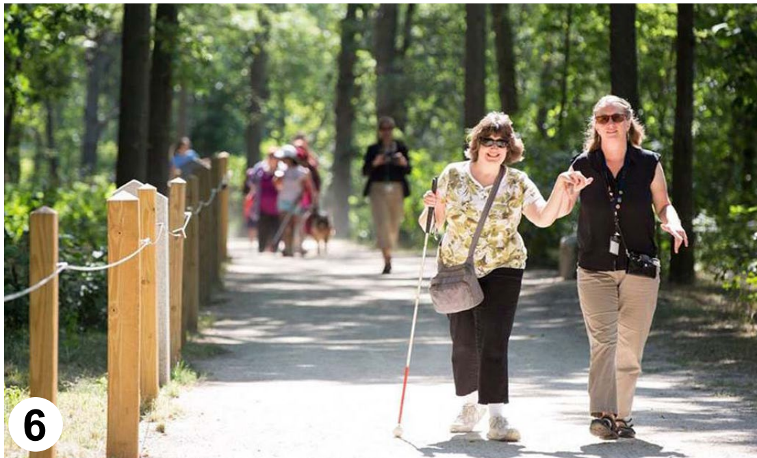
TRAIL FOR VISUALLY IMPAIRED