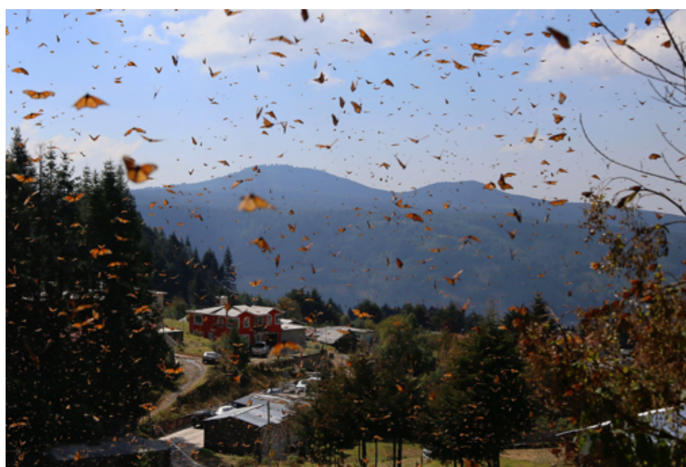
FLUTTER SPEED MEETS SHUTTER SPEED Monarch butterflies fill the air around on the mountaintops in the Monarch Butterfly Biosphere Reserve, a UNESCO World Heritage Site in Michoacán, Mexico.

The migratory monarch butterfly, a subspecies of the monarch butterfly, was recently added to the IUCN's Red List as an endangered species, due to pressures from habitat loss and climate change.